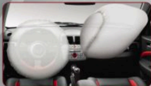
Driver & Passenger Airbags