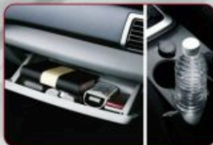
Storage Compartments & Cup Holders