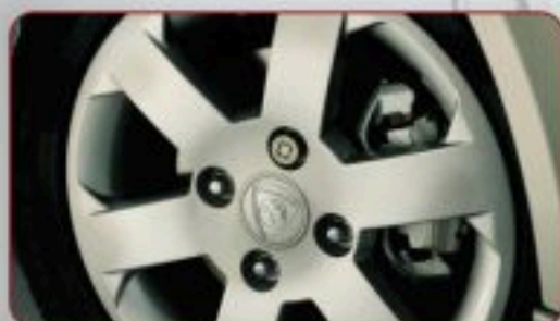
Sleek 15" Alloy Rims